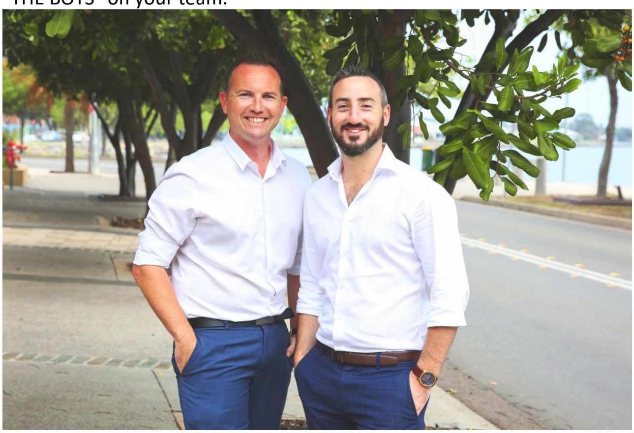
Visit "The Boys" on FACEBOOK

Together "THE BOYS" offer the light and shade for every client with the carisima that a client of any nature can relate to, making them an unstoppable force. If your a buyer, seller or just need some honest and down to earth guidance..... all you need are "THE BOYS" on your team.